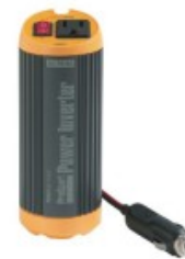
Inverter 12 volts DC to 150 Watts AC

Have sufficient electrical power via a generator or inverter. Thousands of lights can be easily powered with an inexpensive, small 12 volt – 120 volt inverter that plugs into the cigarette lighter socket. The use of dielectric grease at all connections will minimize moisture issues and preserve connections. Determine how large an inverter or generator you will need. Don't underestimate the wattage, as not to overload the inverter. Keep the design simple, concentrating on a basic theme. An excellent idea, effectively carried out will have the most impact with little cost.